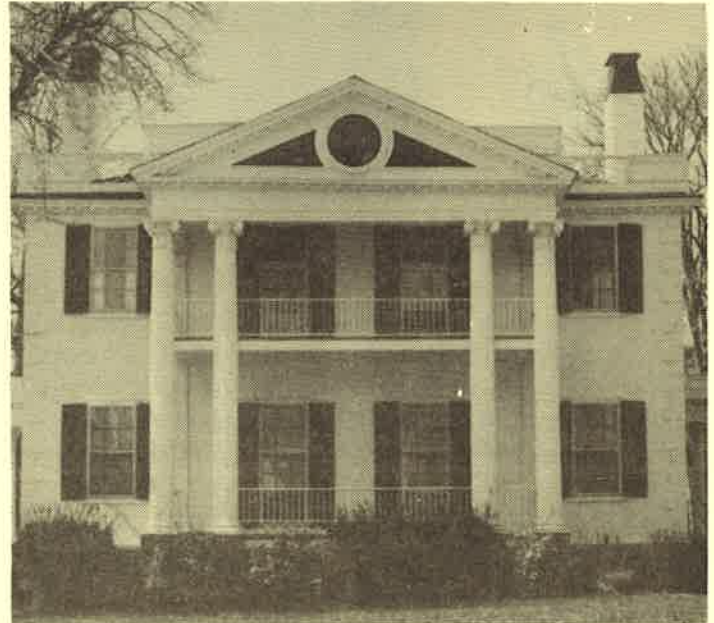
The Alexander House

Sponsors of this Preservation Week event are Hampden Savings Bank, Caffeine's of Springfield and The Coffee Roaster of East Longmeadow. Afternoon tea will be served. Guests will be limited to 100 for the event. There will be an $8 admission fee. For reservations and additional information, please call (413)747-0656 or (413) 732-2687.