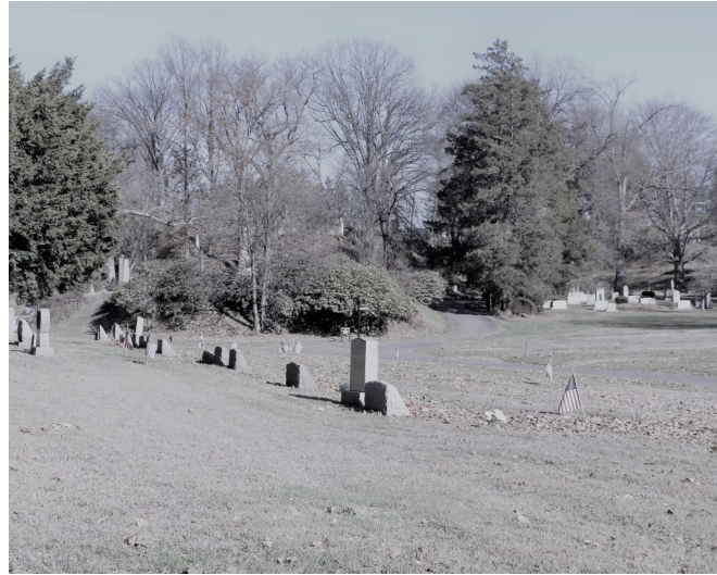
Springfield Cemetery

Springfield Cemetery was established in 1841, and it was part of a trend that involved creating well-landscaped, park-like cemeteries on the outskirts of cities and towns, as opposed to the older, often gloomier Puritan-era graveyards in town centers. The first of these cemeteries was Mount Auburn Cemetery in the suburbs of Boston, which opened in 1831, and many other cities soon followed, including Springfield a decade later. Over the years, it would become the final resting place for many of the city's prominent 19 th century residents, and it remains an active cemetery today.