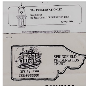
Previous SPT Logos

Specifications: We need a logo that can be used for both print and electronic media such as the SPT letterhead, website, brochures, awards, and exhibits. The logo must be a line drawing with solid color in black and white only. All entries can be submitted either by e-mail attachment to info@springfieldpreservation.org or by mail to: SPT, Attn: Logo Contest, 74 Walnut Street, Springfield, MA 01105 by October 31, 2021. Include your name, address, telephone number, and e-mail address with your entry. For contest rules please email info@springfieldpreservation.org before submitting your entry. Be inspired by the information found on our website: www.springfieldpreservation.org and by looking at our City's incredible number and variety of historic structures.