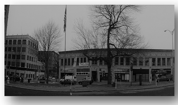
Apremont Triangle and Surrounding Buildings

On February 28 at the Annual Meeting the Springfield Preservation Trust released its Most Endangered List. Our list draws attention to the predicaments that endanger historic buildings, allows the public to comment and suggest ideas for reuse, and connects these properties with potential developers.