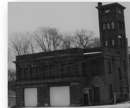
Indian Orchard Fire Station