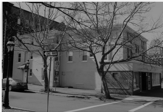
45 Pearl Street