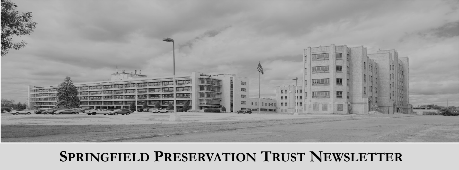
image above is The former Isolation Hospital at 1414 State Street

Springfield Preservation Trust, Inc. 74 Walnut Street Springfield, MA 01105