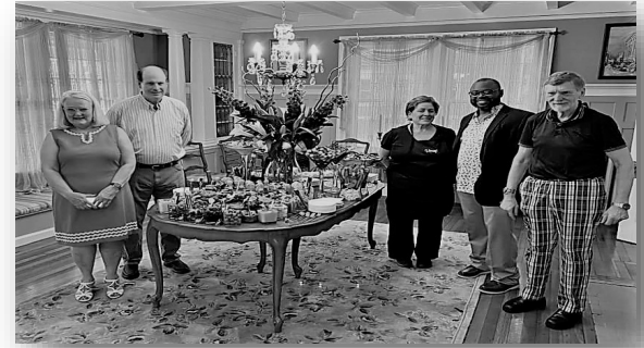
Post Historic Home Tour Social

Thank you home owners, volunteers, SPT board, staff, and visitors for attending the June 25 Historic Home Tour and post tour social. This is the first historic homes tour since 2019. This tour included four historic homes and two churches that over 150 visitors toured. Then a post social in another historic home with over 50 in attendance. Thank you to all who participated in the Historic Homes Tour & Social in Forest Park Heights Historic District—from the homeowners, docents, and door greeters to the visitors, musicians, artists, and caterers! SPT looks forward to next year.