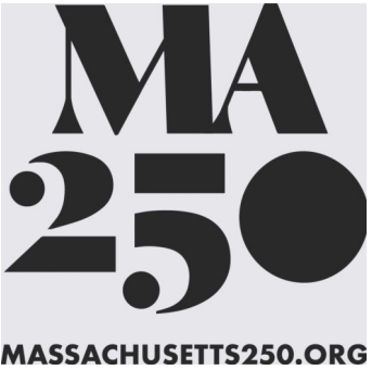
Image MA250, 2025